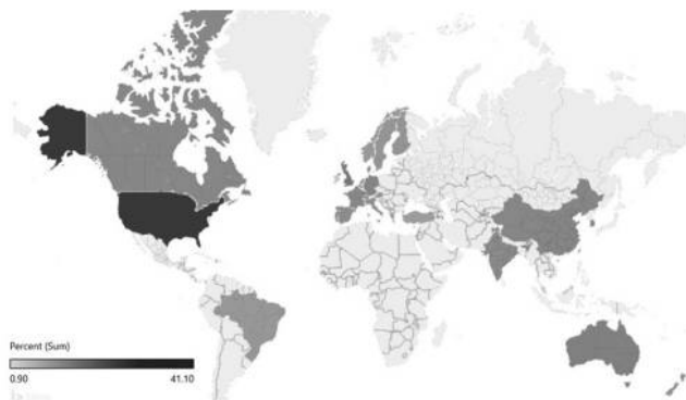
Figure 3 Map of authors

Their work studies in an integrated way relationship benefits and mediators to model the consumer–green brand relationship and provides a better understanding of the antecedents of consumer loyalty towards green brands.